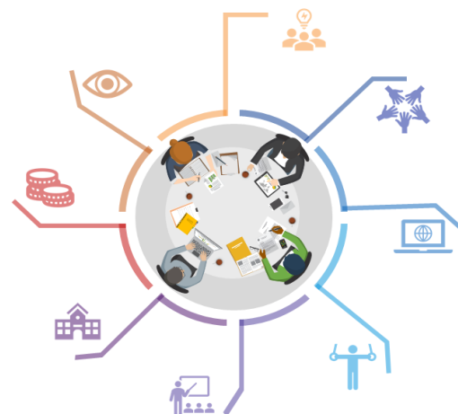
image 2: employers' organisations as L&D hub

To fulfil all eight conditions, our advice is that employers' organisations act as mediators that bring together stakeholders to set up (local) projects. In doing so, employers' organisations take on the role of learning and development (L&D) hubs. In other words, the linking pin in a skills ecosystem in which private and public parties interact to bridge the competence gap (image 2).