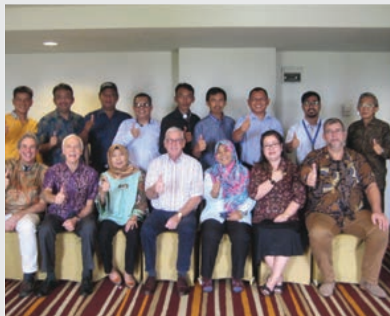
DECP and CNV Internationaal cooperate in Indonesia

In Indonesia, DECP and CNV Internationaal worked together on a training programme on negotiation skills. This program has some elements in common with the achievements in Vietnam, where DECP successfully trained around 30 local trainers to transfer knowledge and train skills in order to increase impact. In April a Memorandum of Understanding was signed between the Indonesian employers’ organisation APINDO and the Indonesian trade union KSBSI, co-signed by DECP and CNV Internationaal. An agreement was reached on the introduction of social dialogue (SD) in the Indonesian regions.