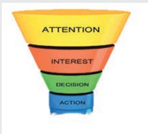
The AIDA model

DECP is a learning organisation. It is not just a group of experienced people who go out and support employers' organisations as isolated units. DECP interacts constantly with others who are working in the same playing field and our main stakeholders the Ministry of Foreign Affairs and VNO-NCW, as well as with scientists who deliver research results and applicable know-how, and – above all – with DECP's partner organisations in emerging countries that want to contribute to the economic prosperity of their members. DECP partner countries benefit from the resulting stable and favourable a business climate, as do Dutch companies on the longer term.