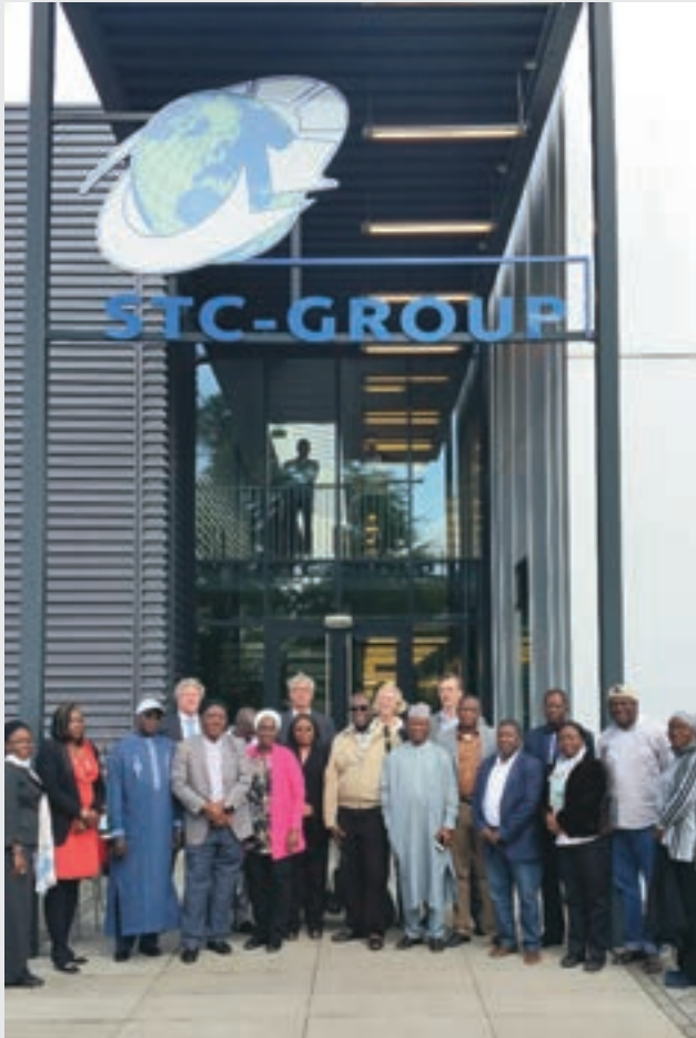
Welcome at the STC-Group, Brielle

than 18. Well-functioning skills development programmes are crucial to creating economic advancement. NECA had asked DECP to develop and organise an enlightening programme.