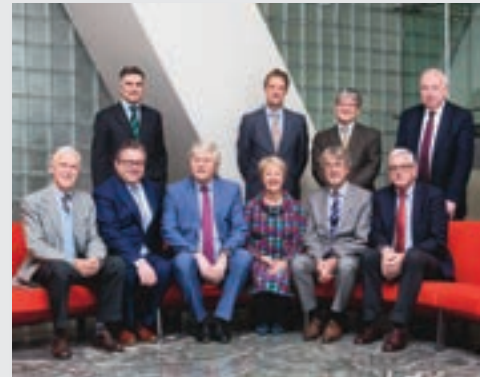
DECP Senior and Office Management 2017.