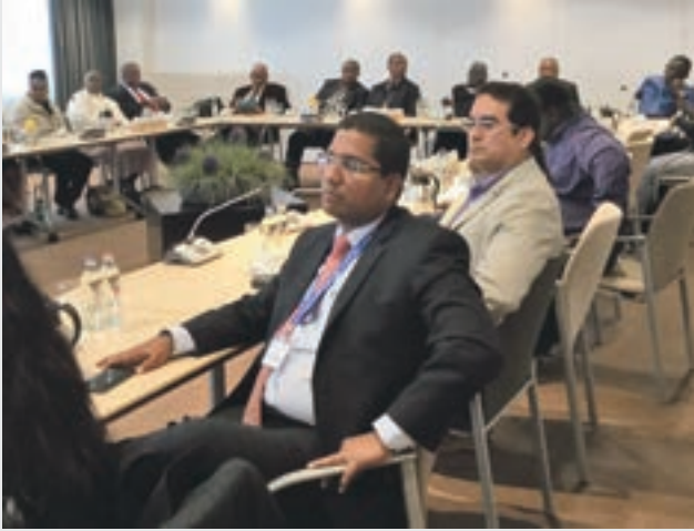
Facilitating board retreats