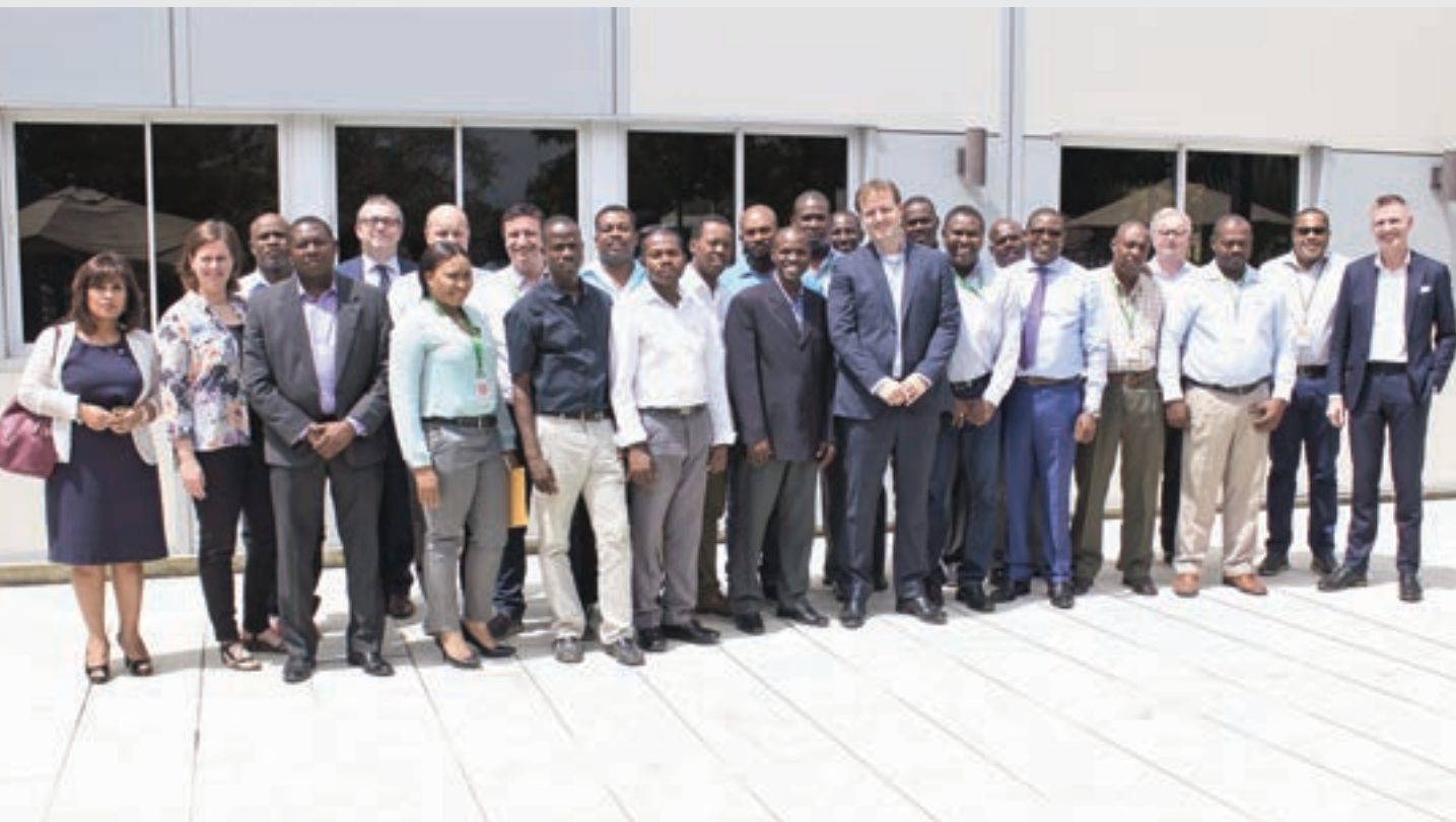
BRANA employees and management work continuously on social dialogue