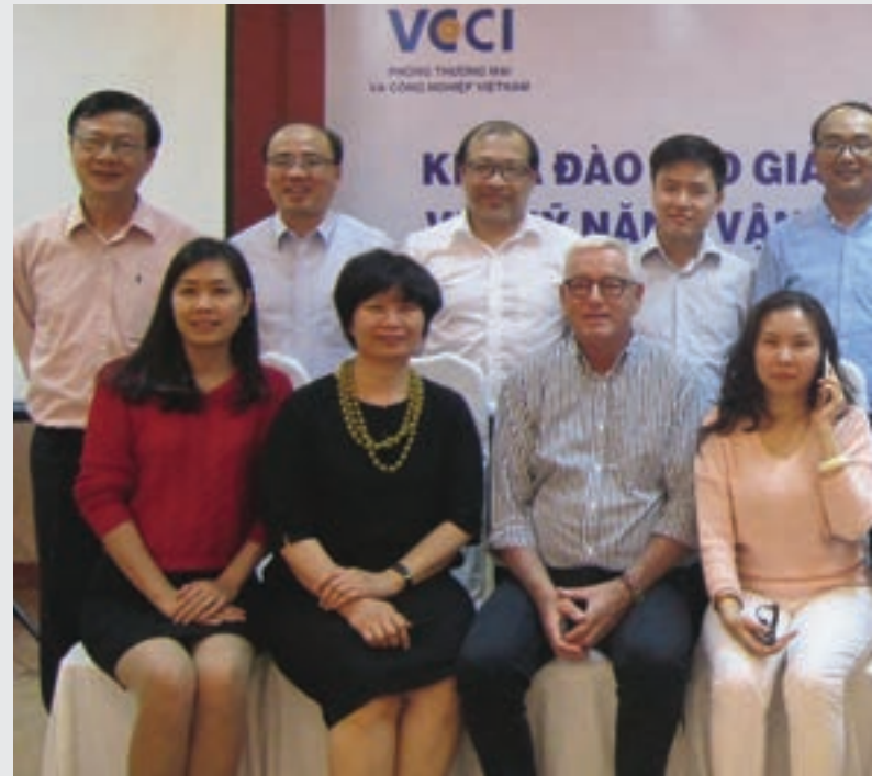
Train-the-trainer. A continuous process

All the trainers are united in the VCCI/VWEC Club of Trainers. 2017 was the first year in which these quali-