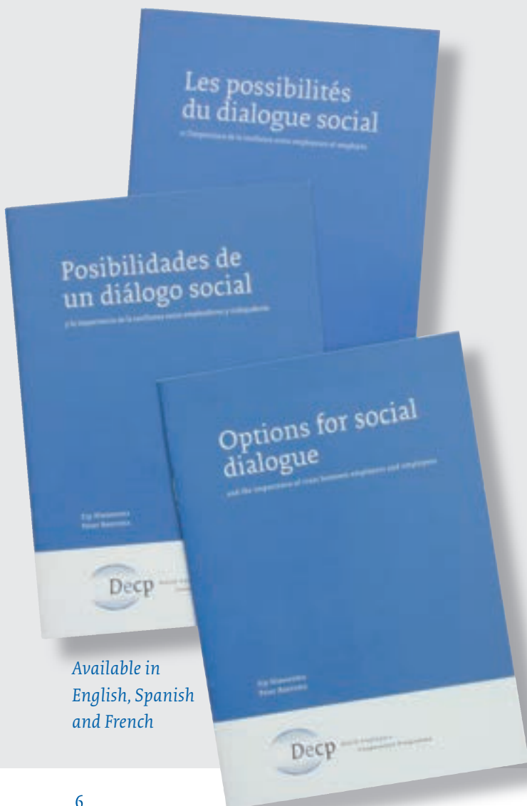
Available in English, Spanish and French

The leaflet 'Options for social dialogue' was published in March 2017 and is available in English, French and Spanish. Partners, likeminded organisations, trade unions and other stakeholders have stated that they find the leaflet very useful.