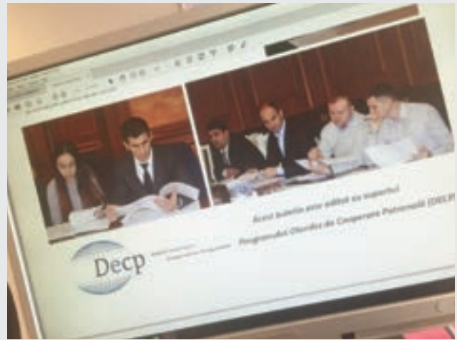
The digital newsletter of CNPM Moldova. Supported by DECP

Working out a clear strategy and business agenda has